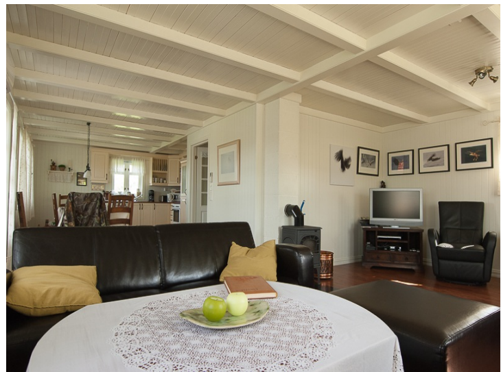
and what a view!