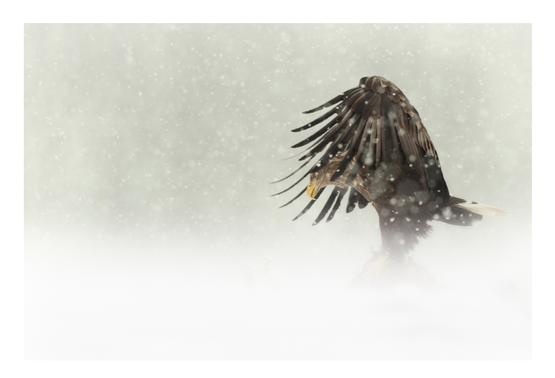
DAYS 2 to 7 – Sunday 15th to Friday 20th February The next few days will be what the trip is all about – Eagles!

The eagle hides are up in the mountains in a stunning wild and unspoilt area. We'll arrive about 1 hour before sunrise as we need to be fully ensconced in the hide long before the eagles can either see or hear us. The walk to the hide is under 5 minutes and is not difficult at all – unless like me you are a bit of a 'shorty' and keep disappearing up to your waist in snow!