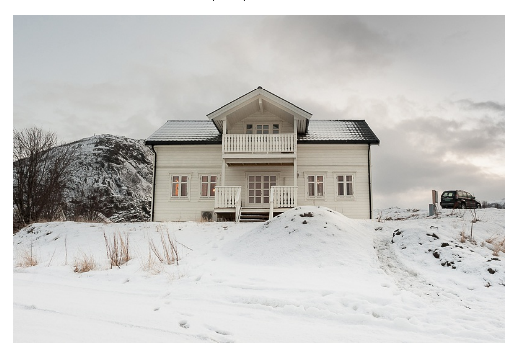
The house that is our base for the duration of the trip

We will arrive in Lauvsnes around 2 hours after our pick up from Trondheim.