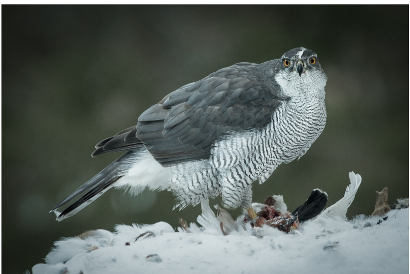
Client Photo by Graham Coull.

There are other hides available to us where we can photograph Red Squirrel, Bullfinch and Crested Tit – together with the chance of Goshawk.